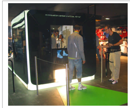
Fig. 1: Installation of the Virtual Mirror in the adidas store, Champs Elysées, Paris.

how the shoes finally look like after being manufactured, the user can step in front of the Virtual Mirror.